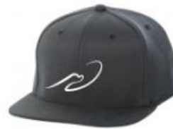
110F ONE SIZE